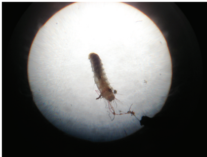
Figure 2 Photomicrograph of the cat flea larva (original magnification 10×).

the culprit. 1–3 Unfortunately, preventative measures such as home fumigation and treatment of pets are costly and may seem excessive when families are sceptical of the diagnosis. 3–4