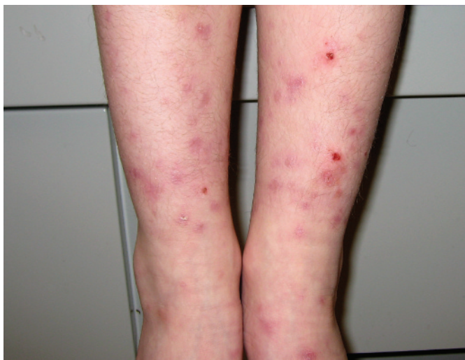
Figure 1 Clusters of excoriated erythematous papules and healing macules on the patient's lower extremities.

Management of papular urticaria – prevention and eradication – is usually implemented without confirmatory evidence of