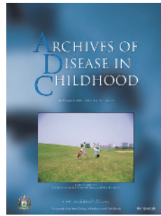
Levels and patterns of physical activity (pp 963–9)

Editor's choice articles are freely available online