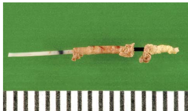
Figure 1 PCVC tip with fibrin sheath (scale in millimetres).

Department of Neonatology, Royal Children's Hospital