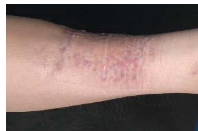
Figure 2 Complete clearing of lesions following local and systemic treatment with tacrolimus.

first reports of successful treatment of a child with pyoderma gangrenosum using tacrolimus.