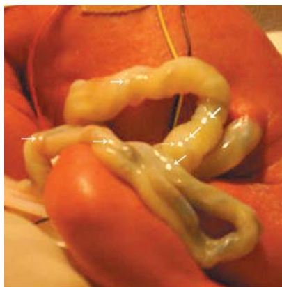
Figure 1 Focal pearly lesions noted in cord (some arrowed).

Congenital candidiasis is associated with increased perinatal mortality and adverse neurological outcomes, with extensive periventricular leucomalacia being common. 1 This baby was the first of twins born by emergency caesarean section at 29 weeks gestation after cervical suture removal. Initial examination revealed multiple pearly white spots embedded in the umbilical cord (fig 1) and an extensive maculopapular erythematous skin eruption with some fissuring. This rapidly evolved into a dry whitish scaly rash. Congenital cutaneous candidiasis with candida funisitis was suspected and amphotericin commenced. Surface swabs and gastric aspirate grew Candida albicans and histology of the umbilical cord revealed necrotising funisitis. There was a marked polymorphonuclear leucocytosis. C reactive protein remained normal. Her subsequent respiratory course was complicated by episodic lobar collapse with excessive thick mucoid secretions. A history of repeated vaginal thrush during pregnancy was obtained.