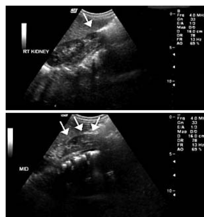
Figure 1 Renal ultrasound showed a mass extending over the midline compatible with the diagnosis of a crossed fused ectopic left kidney.

A crossed fused renal ectopia is an entity where one kidney crosses over to the other side and the parenchyma of the two kidneys fuse. In most cases it involves the left kidney, as in our patient. Renal function is usually normal. Other anomalies associated with this condition are the VACTER syndrome, hydronephrosis, annular pan-