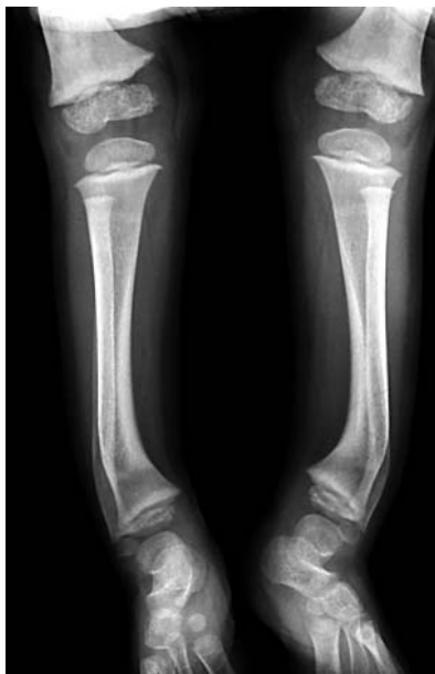
Figure 1 Radiograph of the legs from case 2 showing bilateral distal tibial varus procurvatum deformity.

This child was referred by her GP with an abnormal gait and bowing of her legs. She was breast fed till 1 year of age. From 3 months of age, her mother had excluded