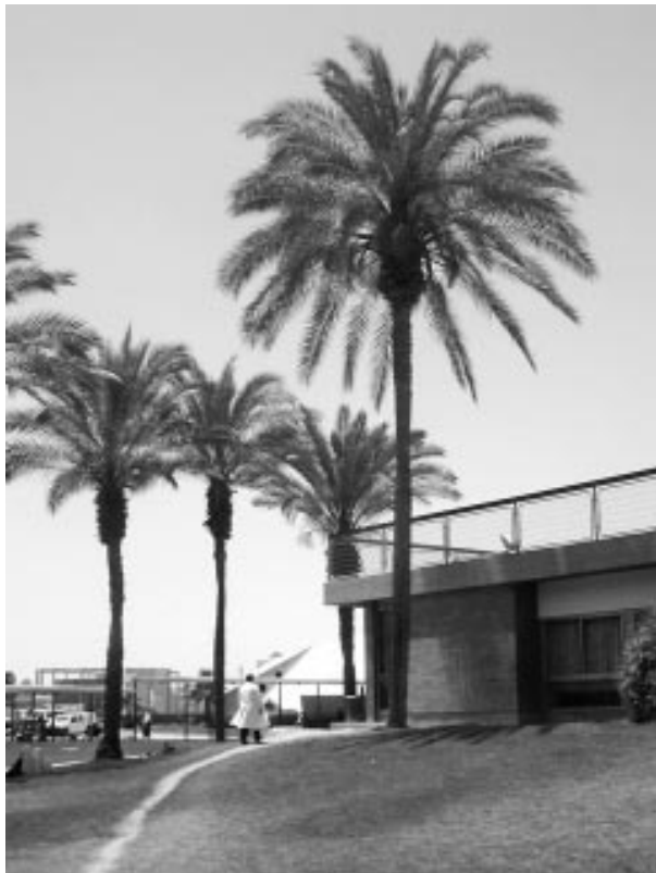
Figure 2 The date palm ( Phoenix dactylifera ).