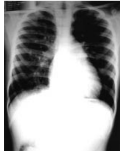
Figure 1 Scimitar syndrome. Chest x ray showing a curvilinear density which extends from the right hilum towards the right hemi-diaphragm which represents the anomalous pulmonary vein.

The following figure should have appeared with the letter by Desai and Babu in the October issue of ADC ( Arch Dis Child 2002; 87 :357).