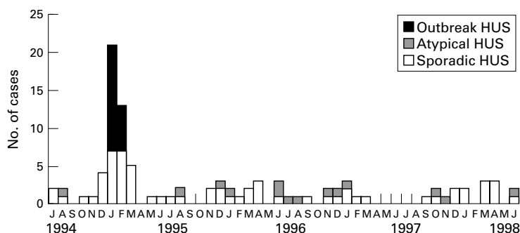
Figure 1 shows the distribution of cases by type and month of presentation. During the entire study period there was a significantly higher incidence of cases during summer months ( \chi^2 test for trend, p < 0.001). This seasonal distribution persisted when outbreak and atypical cases were excluded. However, when the data were analysed by individual year of occurrence, a significant increase in sporadic cases in the summer only occurred in 1994–95, at the time of the outbreak. All sporadic cases

The reported annual incidence of HUS (with 95% CI) was 0.64 (0.52 to 0.78) per 10 5 children under 15 years. Incidence was significantly higher in children under 5 years (1.35 (1.06 to 1.72) per 10 5 ) than in those aged 5–14 years (0.28 (0.18 to 0.39) per 10 5 ; Fisher's exact test, p < 0.0001). When outbreak cases were excluded from the analysis, the overall incidence was slightly, though not significantly lower.