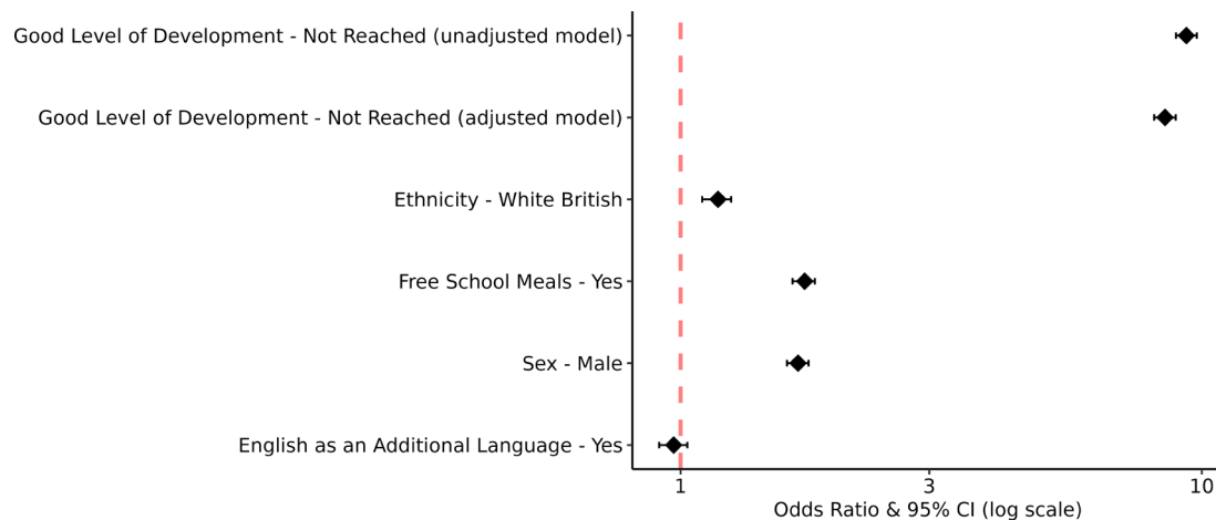
Figure 1 OR and 95% CIs for the association between GLD and SEN status (unadjusted model) and GLD+ethnicity+free school meal eligibility+sex+English as an additional language status (adjusted model). GLD, good level of development; SEN, special educational needs.

Classification rates are displayed in table 3. Positive predictive value was relatively low, with approximately one in two children who did not reach a good level of development later identified as having SEN. However, negative predictive value was high, indicating few children who reached a good level of development were identified as having SEN.