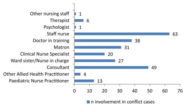
Figure 1 Staff involvement in conflicts experienced.

difficulties 18 and religious beliefs. 19 Other studies have suggested that conflict may arise when relatives are not fully supported to understand treatment and care decisions. 20 Underpinning each of these causes can be different understandings of the clinical situation 21 and different interpretations of futility 22 and likely prognosis. 11