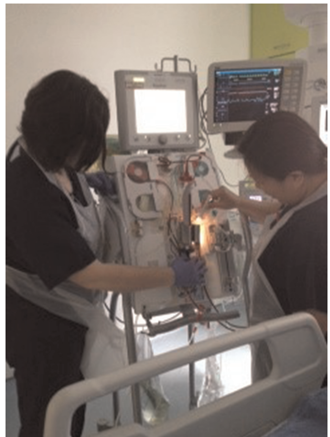
Abstract PO-0788 Figure 2