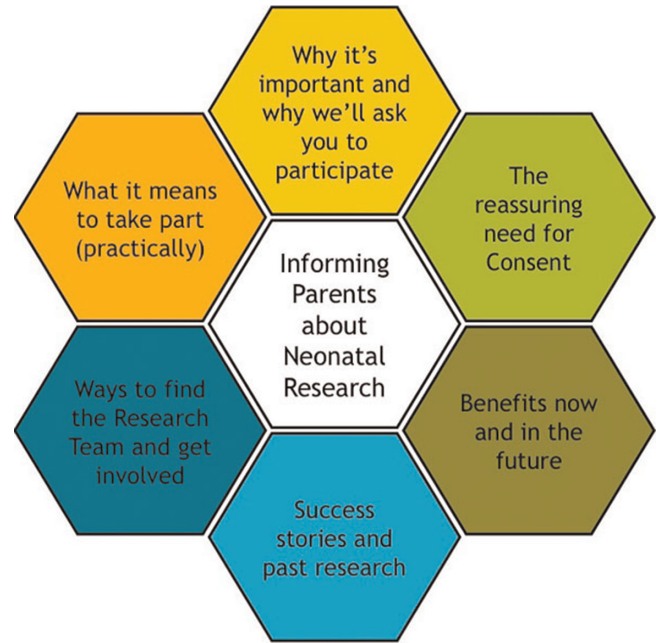
Abstract PS-121 Figure 2 Key topics of information valued by parents

active. Parents can be approached for up to 5 or 6 studies. As a consequence, we observed an increased need for a sensitive management of multi-study approaches.