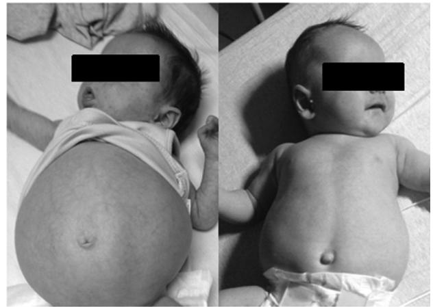
Abstract G361 Figure 2 Clinical improvement via photography